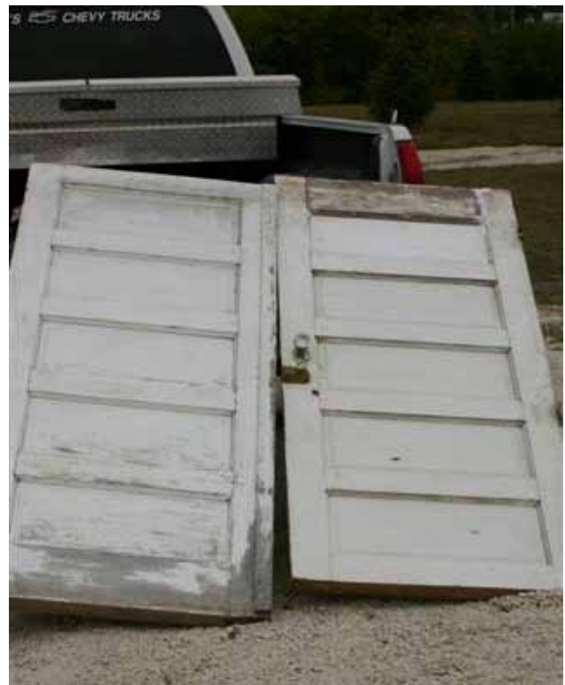
Church doors salvaged during building restoration project.

For more do-it-yourself information, see Manitoba Hydro's Power Smart Energy Guide: Wall Insulation information booklet at www.hydro.mb.ca ; or call Manitoba Hydro at 1-888-MBHYDRO (1-888-624-9376) for a copy.