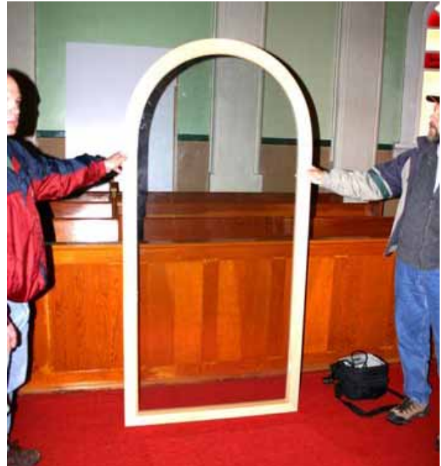
Immaculate Conception Ukrainian Catholic Church, Cooks Creek, MB. New wooden storm windows.

Storm windows can also be installed on the inside of the building. However, the outer sash (the historic window) takes the brunt of the weather and holds condensation in cold weather. Water that collects on the inside of the historic sash can cause decay. If using plastic sheets as interior storm windows, make sure they are removed periodically to allow the historic sash to dry. Also, make sure the historic frame and sash are completely caulked and weather stripped. Be careful not to damage historic window moldings and finishes. 12