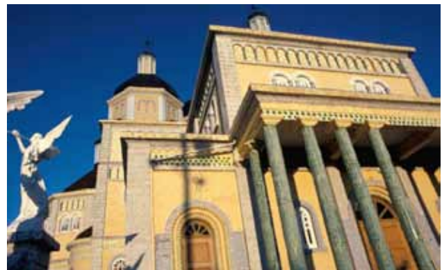
Immaculate Conception Ukrainian Catholic Church, Cooks Creek MB. New storm windows protect the historic wood windows while preserving the beauty and character of the original.

Drafts around windows usually occur because the frame has been improperly sealed or lacks insulation. Installing weather stripping around drafty windows can save nearly 25 per cent in building energy costs. Caulking around window frames can reduce air leaks around the outside of the frame by 90 per cent. 13