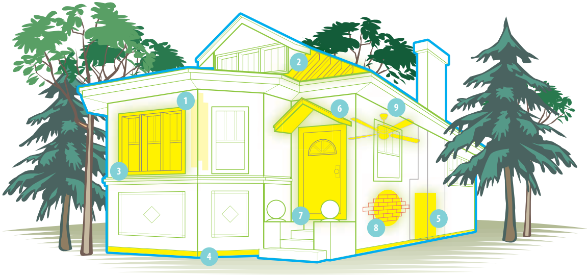
Illustration by mckibillo. Used with permission.

Energy efficiency upgrades to historic buildings should begin with the simplest and least expensive retrofits offering the highest potential for saving energy. With historic materials and systems, a typical “one-size fits all” approach may not be possible. Solutions adapted for the situation may be required. If necessary, contact professionals in historic conservation (ex: architects, engineers and mechanical contractors) for help.