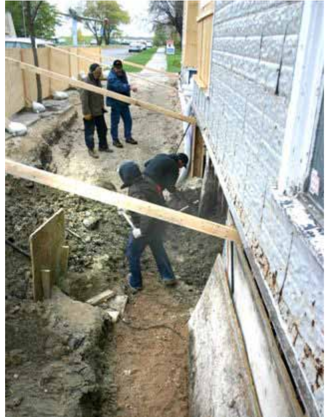
H.P. Tergesen and Sons General Merchant, Gimli, MB. Integrate improvements in energy efficiency into necessary repair work

For more do-it-yourself information, see Manitoba Hydro's Power Smart Energy Guide: Basement & Crawlspace Insulation information booklet at www.hydro.mb.ca ; or call Manitoba Hydro at 1-888-MBHYDRO (1-888-624-9376) for a copy.