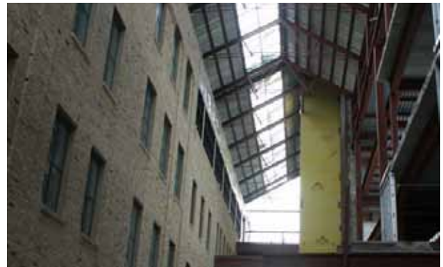
Red River College (Princess Street Campus), Winnipeg, MB The historic lane is preserved as a glass atrium between the two buildings. New and old technologies work together to achieve excellent energy efficiency for the building.

Although care must be taken, there are many improvements and retrofits that can work well in older heritage homes and commercial buildings. This guide will help building owners make informed decisions about which, if any, ecologically friendly changes to make and when to make them. The benefits of the suggestions in this guide are not limited to reducing ecological footprints . They also help preserve our heritage by extending the lives of buildings, while saving money.