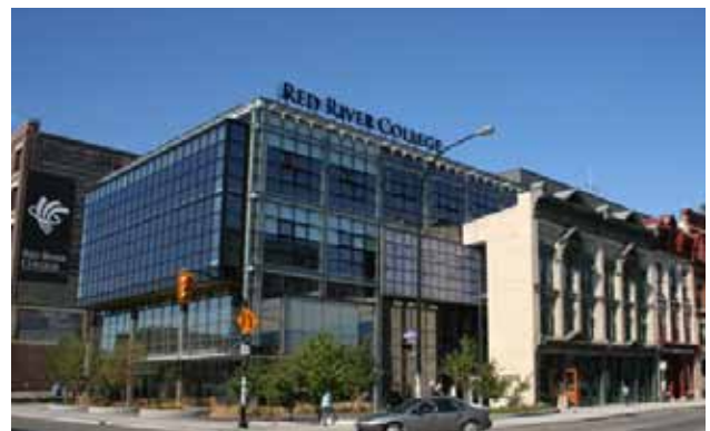
Red River College (Exchange District Campus), Winnipeg, MB Adaptive Re-use. The facades of heritage buildings along Princess Street are re-purposed for the new complex rather than demolished.