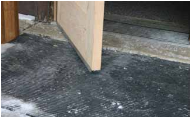
Former CPR Station, Portage la Prairie, MB. Adding weather-stripping to the refinished door provides a weather tight seal.

For more do-it-yourself information, see Manitoba Hydro's Power Smart Sealing, Caulking and Weatherstripping information booklet at www.hydro.mb.ca ; or call Manitoba Hydro at 1-888-MBHYDRO (1-888-624-9376) for a copy.