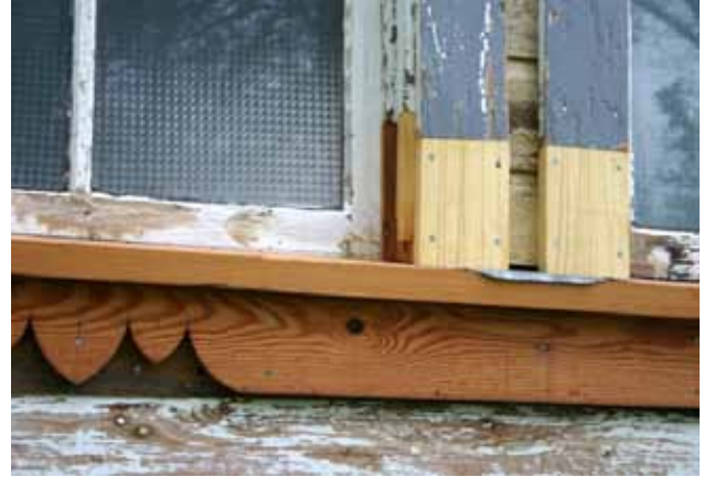
St. Paul's Anglican Church, St. Francois Xavier area, MB. Detail of repaired wood window frames

Retrofitting should be limited to measures that provide reasonable energy savings, at reasonable costs, with the least intrusion or impact on the character of the building. Overzealous retrofitting, which introduces damage to historic building materials, should not be done.