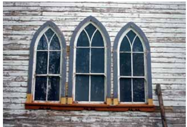
St. Paul's Anglican Church, St. Francois Xavier area, MB. Window frames are retained and repaired by piecing in new material to match the old

If you are interested in conservation but your building is not designated, you can perform your own assessment of the character-defining elements of the building. These often include: windows, exterior cladding, roofs, porches or entrances; and some interior features and finishes. (Note: The US National Park Service offers an excellent interactive website to help property owners identify the distinctive materials, features, and spaces of the building to conserve. Visit: Walk through Historic Buildings: Learn to Identify the Visual Character of a Historic Building at http://www.nps.gov/history/hps/tps/walkthrough/start.htm